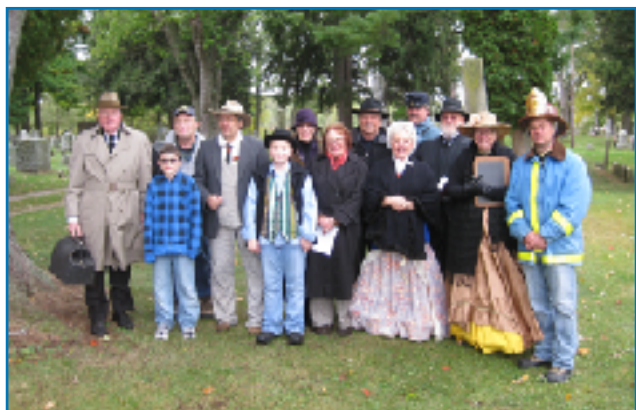
The Characters from our 2010 Tour