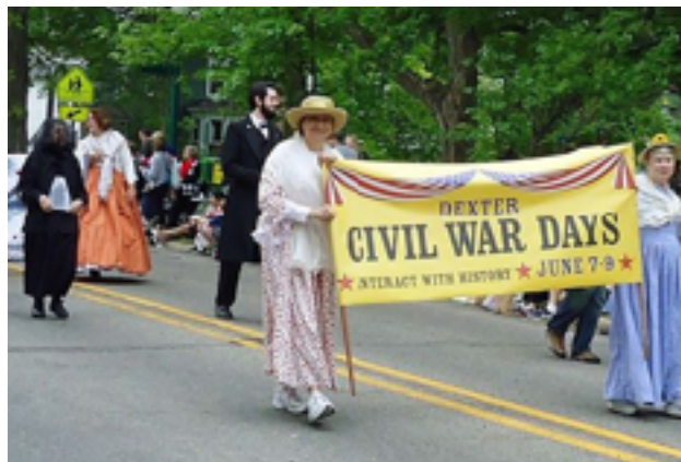
2015 Memorial Day Parade

Dexter's wonderful Memorial Day Parade takes place this year on Monday May 26 at 10am. This traditional parade, sponsored by the Dexter Rotary Club, is one of Dexter's defining small-town joys. Come march with DAHS and see the parade from a whole new perspective! Kids are welcome when accompanied by an adult. Sorry, no animals. To participate, please contact us at 734-476-5232 or dextermichhistory@gmail.com