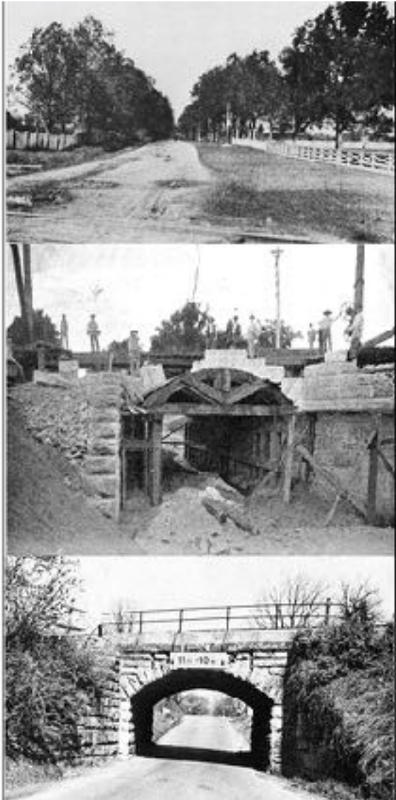
Before, during and after construction

With the recent interest of the Fourth Grade Students from Wylie Elementary School, the Train Viaduct has once again become a topic of interest. We have decided to rerun the article we published in our Newsletter a number of years ago. This article appeared in the Dexter Leader, December 20, 1979: