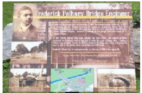
Wylie 4th Grade Project 2017-2018

On the right is the poster that stands near the corner of Jeffords and Main Streets, placed there by the Wylie 4th graders, and dedicated on May 23, 2018.